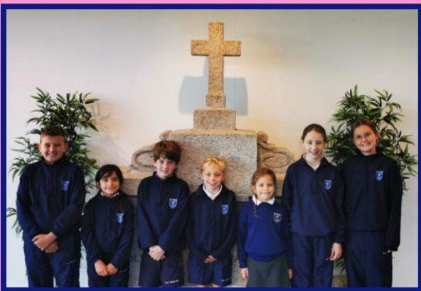
Amber Flag Committee 2024-25

Over the last number of weeks the teachers involved have been selecting members for our very Active Green Schools Committee, Amber Flag Committee and Student Council. These groups work throughout the year to make Holy Cross a better place and we are very lucky to have children who take such an interest in developing our school. We must also thank the various staff members who facilitate such brilliant work across all of the groups. We look forward to hearing more about what they have planned throughout the year!