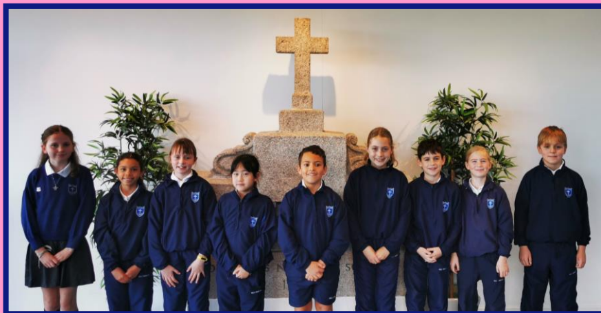
Student Council 2024-25