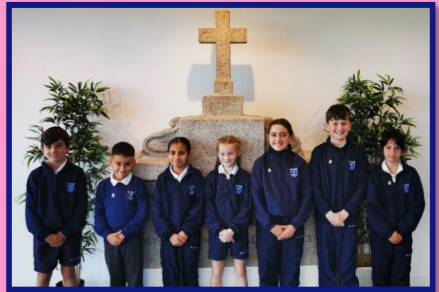
Green Schools Committee 2024-25